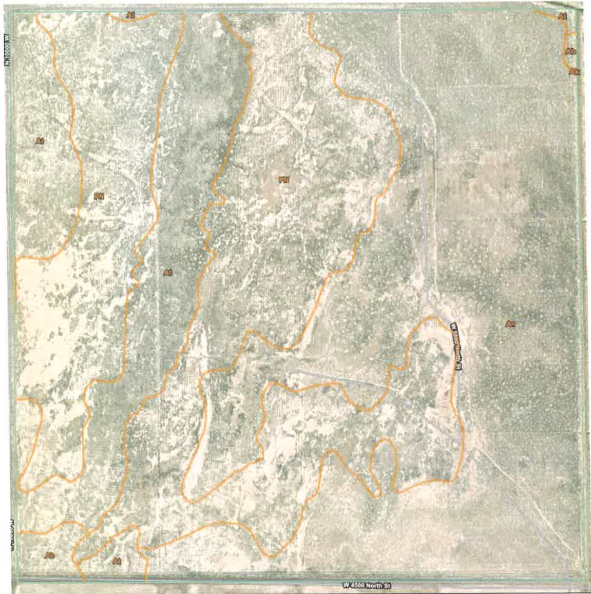
Tables — Range Production (Normal Year) — Summary By Map Unit